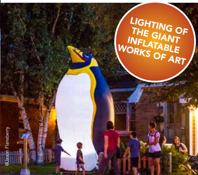
Graphic Design: Martine Mongrain, cgrt - 2017